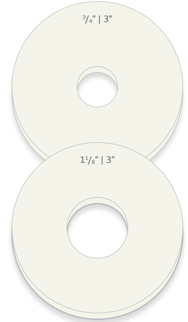
Available thicknesses: 2.5 mm (thin)