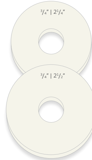
Available thicknesses: 2.5 mm (thin) 4.2 mm (thick)